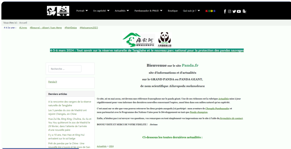
Screenshot of panda.fr website